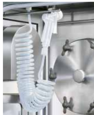
Clever cleaning system

Never get your hands dirty again! Integrated, automatic WIP system cleaning. Perfect accessibility for the manual cleaning of the isolator housing. And naturally with centralised waste water disposal.