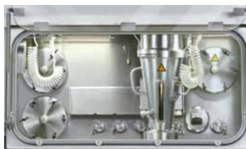
Glatt GPCG 2 Isolator