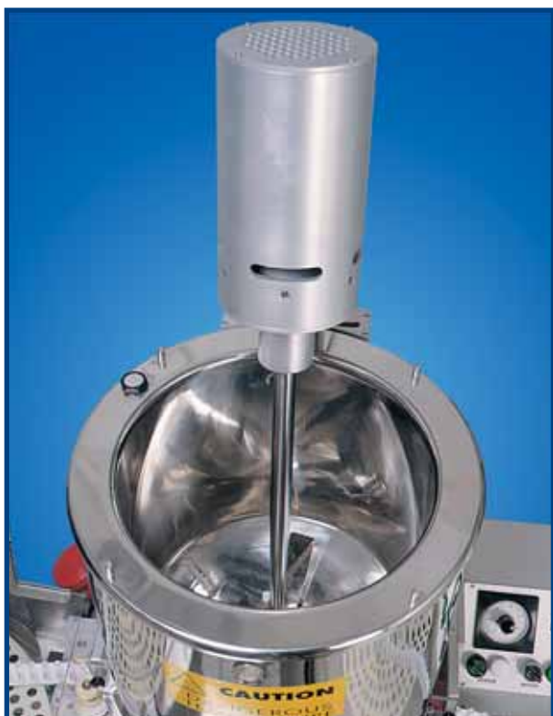
Variable speed mixer inside the hopper