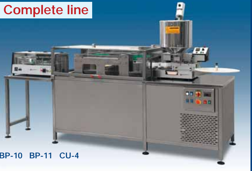
BP-10 BP-11 CU-4