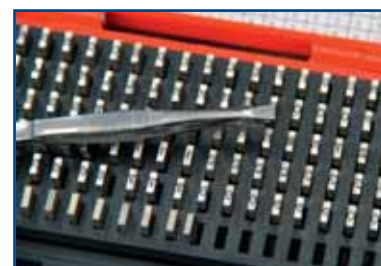
Box of 100 characters