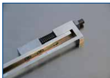
Stainless steel ribbon