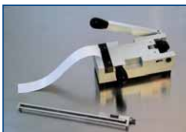
Coding writing group